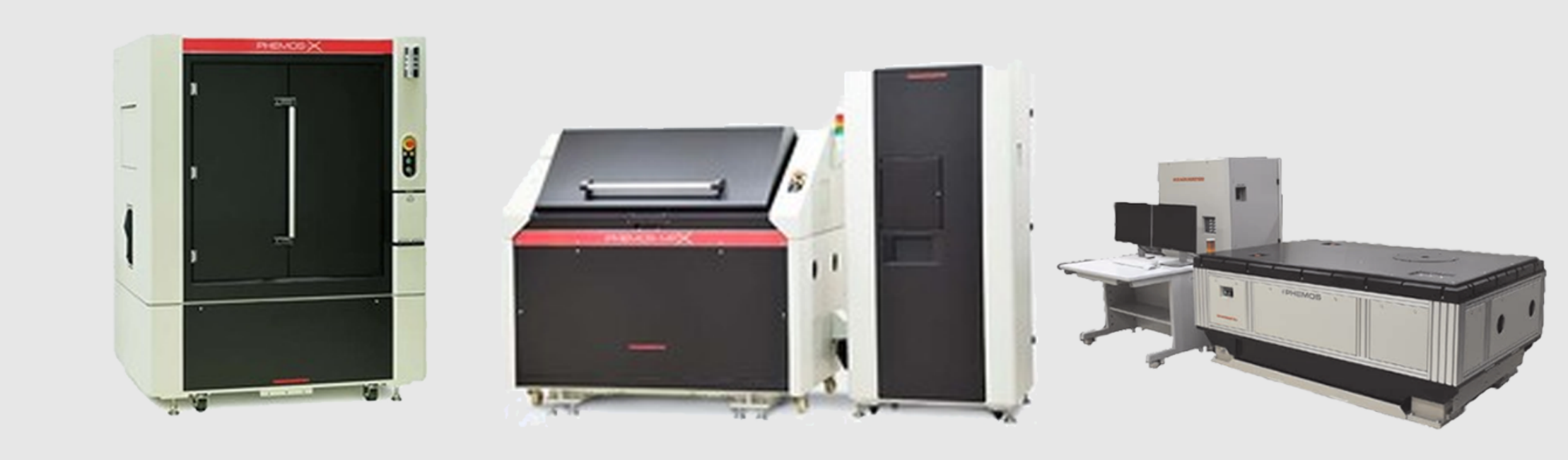
Photo Emission Microscope (Phemos) Inverted Photo Emission Microscope (iPhemos) Pico-Second Time Resolved PEM IR-OBIRCH Analysis System